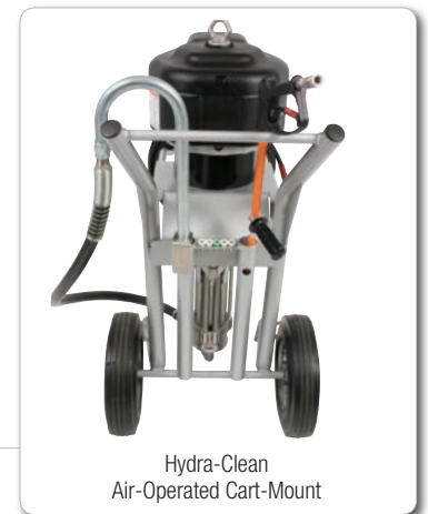
Hydra-Clean Air-Operated Cart-Mount