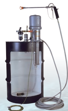
Hydra-Clean Air-Operated 10:1 Drum-Mount