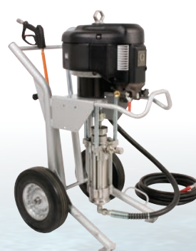
Hydra-Clean Air-Operated Cart-Mount