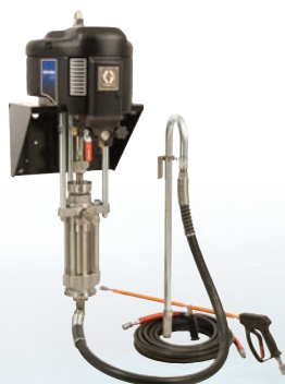
Hydra-Clean Air-Operated Wall-Mount

*Hose Reel is only included with cart mount package 24W474