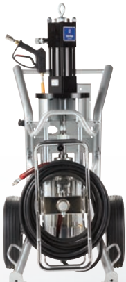
Hydra-Clean Hydraulic Cart-Mount*